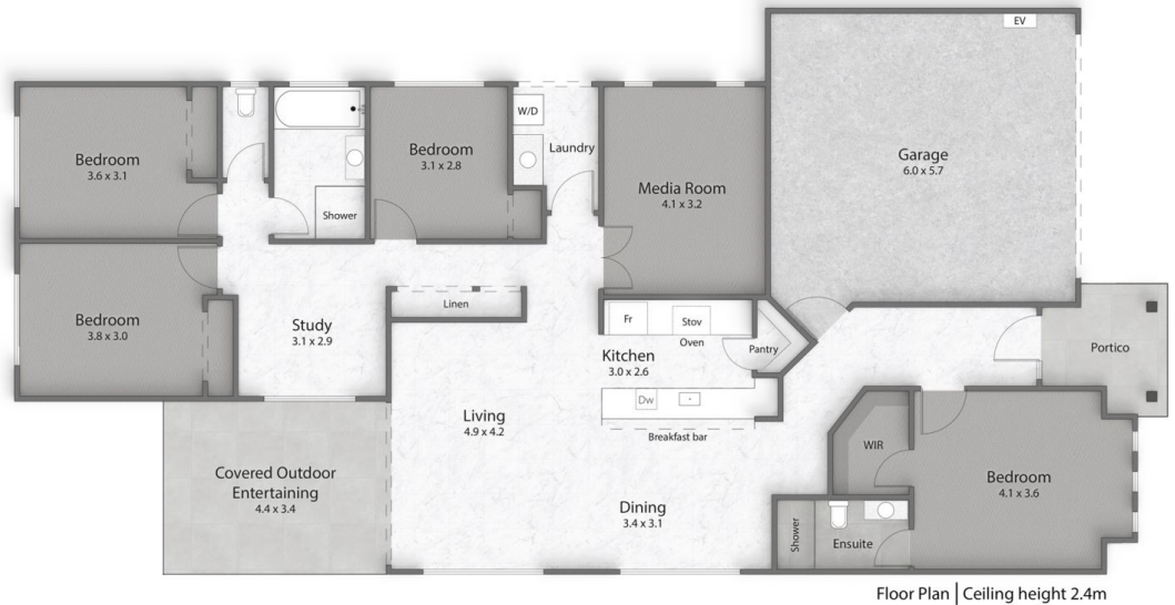
Floor Plan | Ceiling height 2.4m