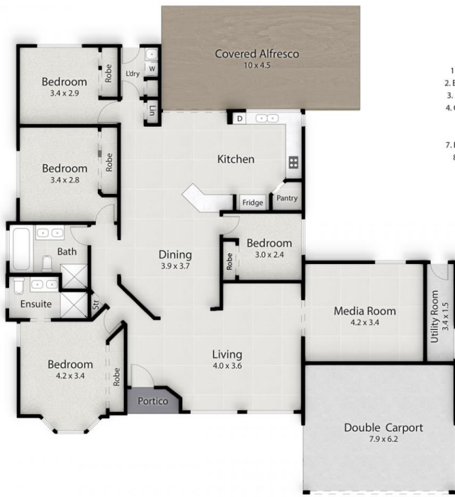
: Floor Plan